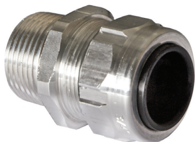
ABB cable glands – ASG series General purpose aluminum cable glands

Ideal for installations such as robot manufacturers, packaging equipment, machine tool building and other industrial OEM and MRO applications.