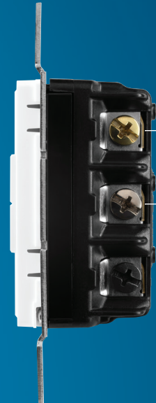
Maestro PRO LED Dimmer MA-PRO-XX*