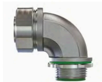
Shown with Optional Bushing