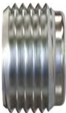
Ordinary Locations Steel Reducing Bushings