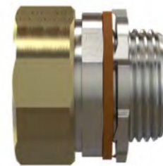
Furnished with a UL Listed Steel Locknut Sealing Washer