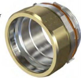
RT Compression Connector