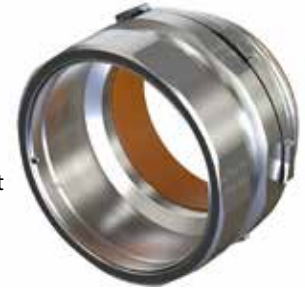
Compression Connector Above with Insulated Bushing