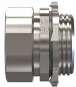
Furnished with a UL Listed Steel Locknut