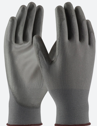
PIP® 33-115 Reusable Coated Glove Sized XS-2XL Available in white and gray (33-G115)

*Price based on future costs being quoted currently for Exam grade disposable nitrile gloves Cost of Use calculation does NOT include hidden costs of disposable gloves related to lowered productivity or treating work injuries or skin conditions related to disposables.