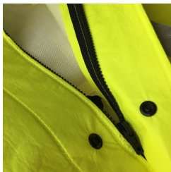
QUALITY Storm fly front with zipper.