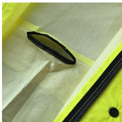
SAFETY Fall protection access.