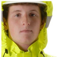
PROTECTION Hood in collar.