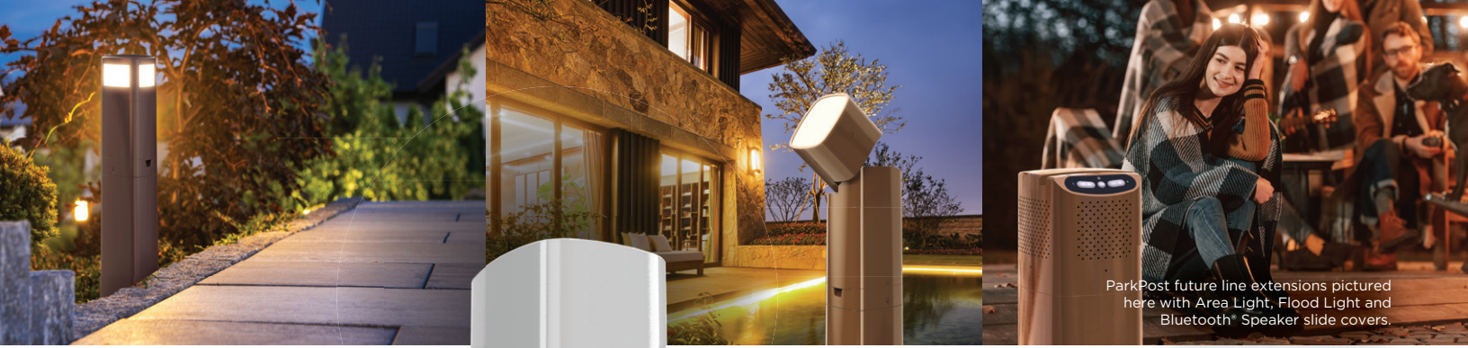
ParkPost future line extensions pictured here with Area Light, Flood Light and Bluetooth® Speaker slide covers.