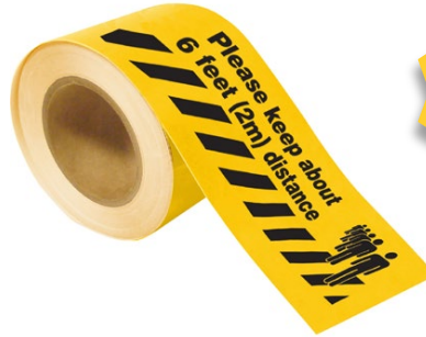
Catalog # Size 170216 4 in. x 100 ft.