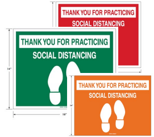
Catalog # Size 170213 14 in. x 18 in. 170214 14 in. x 18 in. 170215 14 in. x 18 in.

ALL PPE LIMITED TO SUPPLIES ON HAND To learn more call us at 800-266-9111 or visit 1sourcedist.com .