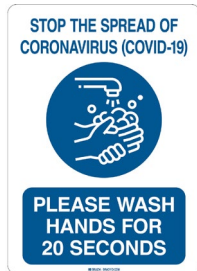
Catalog # Size 170183 14 in. x 10 in. 170180 10 in. x 7 in. 170181 14 in. x 10 in. 170182 10 in. x 7 in.