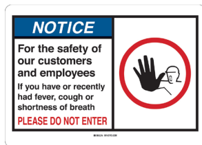
Catalog # Size 170196 7 in. x 10 in. 170197 10 in. x 14 in. 170198 7 in. x 10 in. 170199 10 in. x 14 in. 170200 7 in. x 10 in. 170201 10 in. x 14 in.