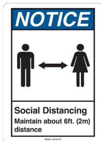
Catalog # Size 170207 10 in. x 7 in. 170208 14 in. x 10 in. 170209 10 in. x 7 in. 170210 14 in. x 10 in. 170211 10 in. x 7 in.