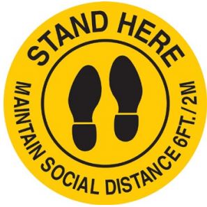
Catalog # Size 170215 17 in. (diameter)