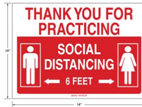
Catalog # Size 170204 10 in. x 14 in. 170202 7 in. x 10 in. 170203 10 in. x 14 in. 170217 7 in. x 10 in. 170205 7 in. x 10 in. 170206 10 in. x 14 in.