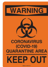
Catalog # Size 170190 10 in. x 7 in. 170191 14 in. x 10 in. 170192 10 in. x 7 in. 170193 14 in. x 10 in. 170194 10 in. x 7 in. 170195 14 in. x 10 in.